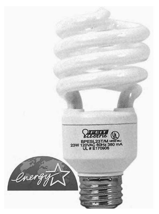
Figure 4-7 A "twist" CFL from Feit Electric. This new design will fit into almost any standard fixture designed for an incandescent lamp. However, these lamps consume only one-fourth the wattage that a standard incandescent would consume. Average rated life is 10,000 hours, as compared with less than 1,000 in an incandescent.

features. There are two main varieties available: electronic and manual. Access to many electronic safes is monitored from a panel at the front desk, and if the hotel charges a fee for their use, the system can electronically post the charge to a guest's folio. Guestroom safes come wall-mounted, floor-mounted, and hidden inside nightstands and armoires (see Figure 4.8). Normal access to the safe may be through a common key, a keypad, the use of a special card, or even a standard credit card. Other features to look for when selecting guestroom safes are interior dimensions and fire ratings.