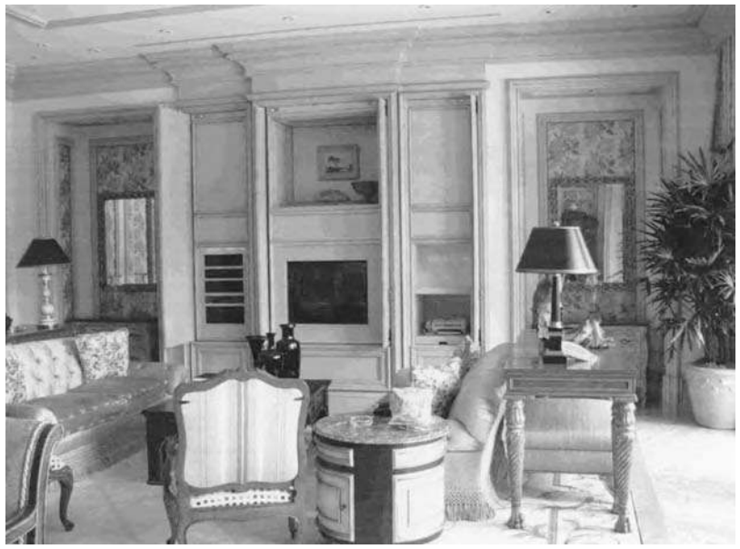
Figure 4-4 A far more formal sitting room in one of the Bellagio's Villa Suites. The second photo is of the same room with the doors of the entertainment center opened.

construction in case furniture should always have concealed dovetail joints in the front piece to ensure that constant motion of the drawer will not cause the drawer front to become detached. Laminated tops are an essential element of most institutional furniture. Spilled drinks and beverage rings would quickly mar the finish and stain ordinary wood furniture.