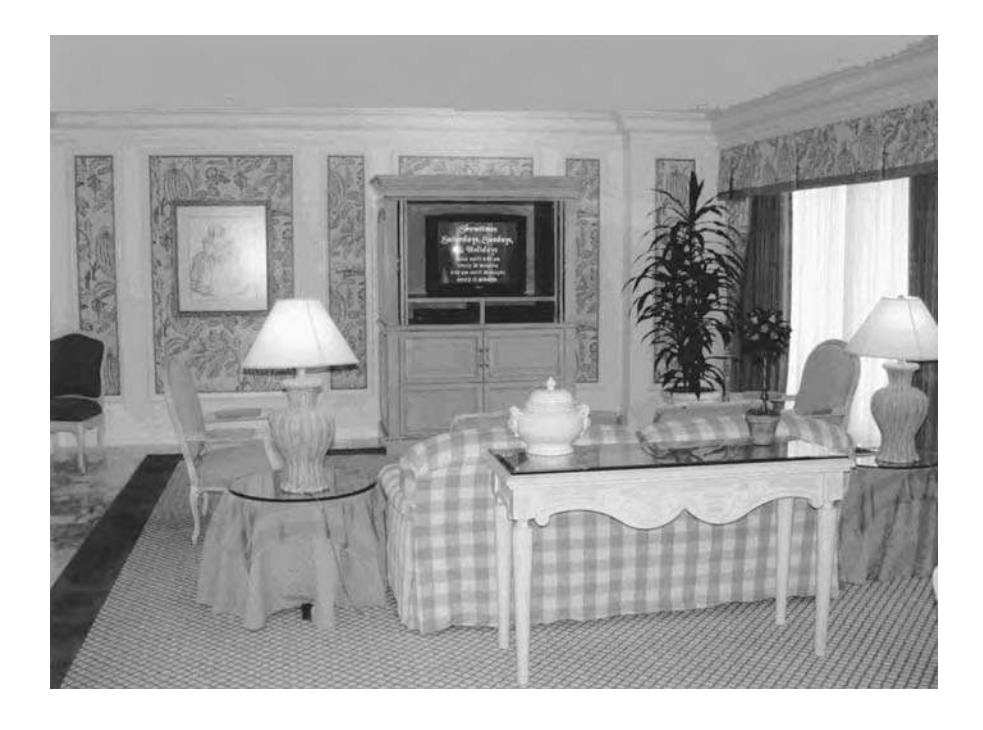
Figure 4-3 Standard junior suite furnishings with an English countryside flavor. Note the use of fabric on the end tables.

luggage racks, chests of drawers, and pieces that provide storage are known as case furniture or case goods , and are primarily constructed with dovetail joints. Some metal pieces will be used in the construction of case furniture for drawer guides and luggage receivers. Drawer