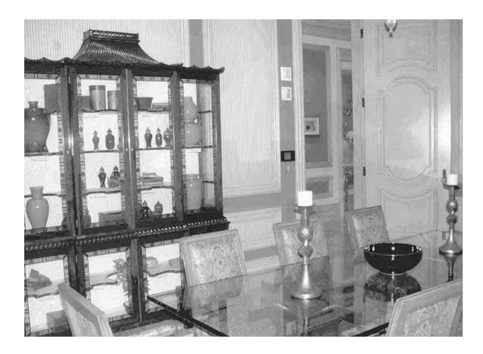
Figure 4-5 An opulent dining room in the same suite featured in Figure 4.4. Note the Chinese influence in the furnishings.

PLASTIC FABRICS. Plastic fabrics have a leatherlike finish and are used in furniture construction. They may be wiped clean with a soapy cloth or sponge. Plastic fabrics may also be found in mattress ticking and blackout drapes.