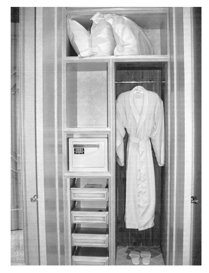
Figure 4-8 A dressing area closet with a built-in guestroom safe and a cedar lining.

A new and potentially very profitable fixture in the modern guestroom is the in-room refreshment center or minibar. Stocked with sodas, juices, liquor, and snacks, the minibar is a tempting convenience that few guests can resist. As with guestroom safes, there are dozens of companies and hundreds of models from which to choose. Minibars can either be leased or purchased outright by the hotelier. A number of companies lease the