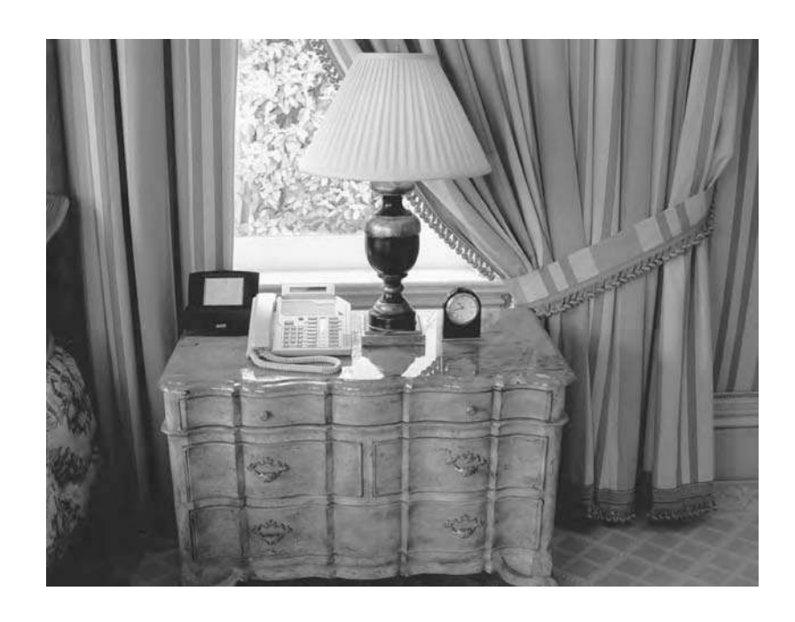
Figure 4-10 In the Villa Suites at Bellagio, a state-of-the-art communication and control system has been installed for the guest's convenience. It can do everything from opening the drapes to summoning the butler. These touch pads are conveniently located throughout the suite, from the night table, as shown in the first photo, to the wall of the dining room shown in the second photograph.