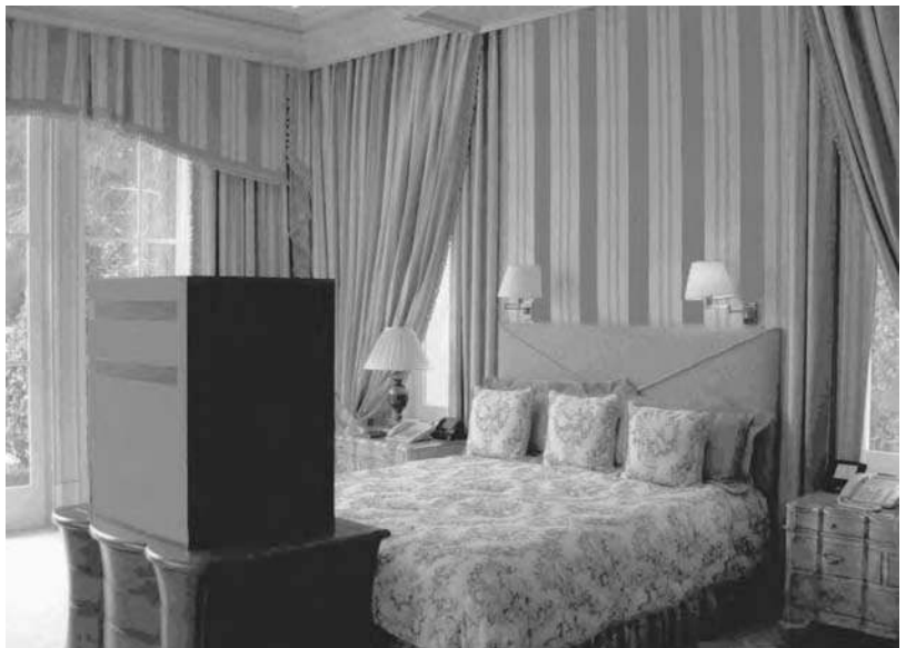
Figure 4-6 Assistant Executive Housekeeper Raynette McGiness updates the status of the Villa at Bellagio. Note that the large chest at the end of the bed in the first photograph is actually a large-screen television that pops up on command from a console located on the nightstand.

This reduces the possibility of scorched fingers and the prospect of groping about in the dark for the switch. Floor lamps are seldom, if ever, used in modern hotel construction because of the space used and the tripping hazard created by unsightly cords.